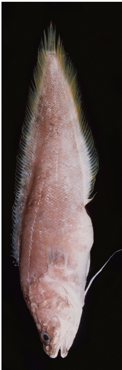
Fig. 1. Holotype of Tuamotichthys marshallensis . Female, standard length 120 mm. BPBM 19961.

of small boat passage, outside reef, steep drop-off with caves, rotenone, 46–55 meters, coll. J. E. Randall, N. A. Bartlett, P. Bartlett and K. Burnett, 7 April, 1976, BPBM 19961 (Bernice P. Bishop Museum, Honolulu). Paratype: Female, 111 mm SL, same data as for holotype, ZMUC P771494 (Zoological Museum, University of Copenhagen).