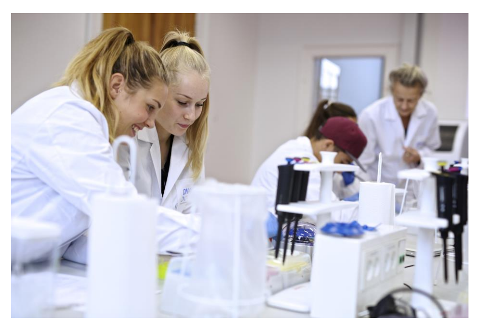
Figure 3. Students contribute to the museum scientists' research projects which enables testing at a much larger scale than otherwise possible. The collaboration with scientists is highly motivating for the students.