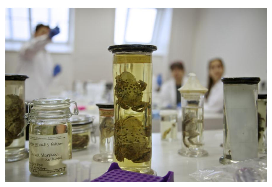
Figure 1. The environmental DNA-method is based on the fact that all living things release DNA into their environment. This makes it possible to detect both rare, common and invasive species of a broad range of organisms in a single water sample from a lake or pond. (Photo: Christian Mailand, DNHM).

When looking at the results and comparing them to databases the students view three different curves, which represent a positive and a negative control sample as well as their own lake sample. The control samples are included as quality assurance for both students and researchers to make sure that the lab work has been carried out satisfactorily. Occasionally the students experience the frustration, which scientists also experience now and then when their preparatory work has been flawed and the result doesn't make sense. Other times they don't detect DNA – which doesn't necessarily mean that the lake is lifeless, just that they didn't catch the DNA. On the other hand, euphoria can set in if the students find a species which they didn't (or did) expect to find in the lake!