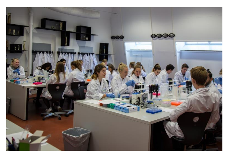
Figure 2. DNA og Liv moves students from classrooms to lakes to labs. So far more than 300 high school classes from all parts of Denmark have participated in the project. (Photo: Anders Peter Schultz, DNHM).

When looking at the results and comparing them to databases the students view three different curves, which represent a positive and a negative control sample as well as their own lake sample. The control samples are included as quality assurance for both students and researchers to make sure that the lab work has been carried out satisfactorily. Occasionally the students experience the frustration, which scientists also experience now and then when their preparatory work has been flawed and the result doesn't make sense. Other times they don't detect DNA – which doesn't necessarily mean that the lake is lifeless, just that they didn't catch the DNA. On the other hand, euphoria can set in if the students find a species which they didn't (or did) expect to find in the lake!